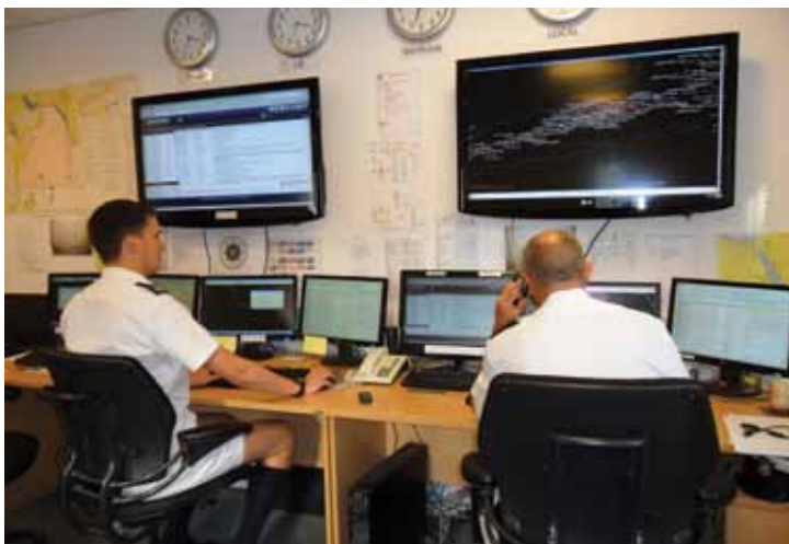
Operations room UKMTO

It is important that vessels and their operators complete both the UKMTO Vessel Position Reporting Forms and register with MSCHOA