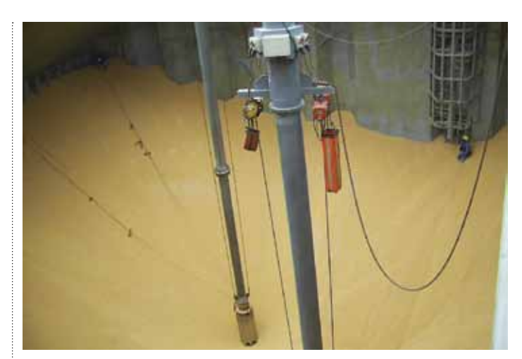
^ Maize discharging