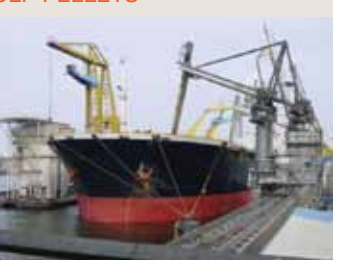
^ Discharging specialised grain birth

Barges loaded with the damaged cargo were ordered to shift to berths away from the city centre because of the smoke and foul smell.