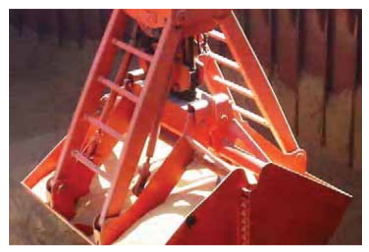
^ Grab discharging seedcake

The ruling by the IMO is understood to be provisional and due for review in December 2011.