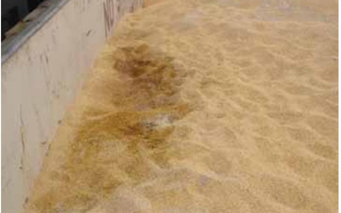
^ Seedcake cargo with water damage