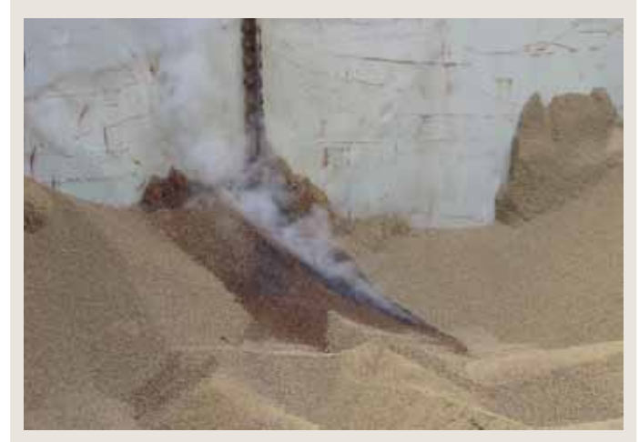
^ Self heating seedcake

A ship carried 55,000 tonnes of soybean meal from Brazil to Thailand. On discharge, it was found that some of the cargo against the engine room bulkhead in the after most hold was discoloured (dark brown), overheated and partly caked.