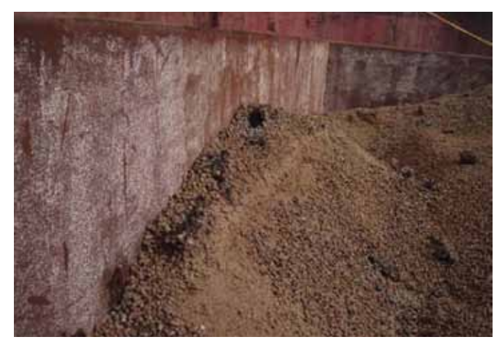
^ Wet seedcake with mould, self heating

Self-heating leading to spontaneous combustion in a cargo of seedcake can be triggered by microbiological activity or exposure to a source of elevated temperature in the hold or both. In respect of UN 1368 (a) seedcake (which presents the highest risk of self-heating), the cargo temperature shall not be greater than 10°C above ambient temperature or 55°C, whichever is the lower, prior to loading. There have been instances of 'non-hazardous' type seedcake self-heating and, in one case, the cargo was removed before it ignited.