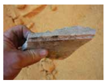
^ Large pieces of cement contaminating the cargo

^ Cement residues in less accessible parts of the hold