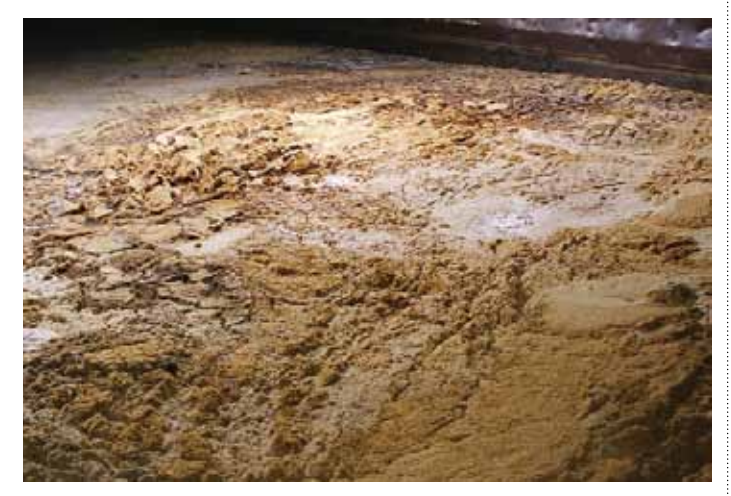
^ Water-damaged seedcake

The image below show seedcake with water damage, resulting in mould, caking and discolouration of the cargo. A ship with leaking hatch covers may be subjected to claims of 'unseaworthiness'.