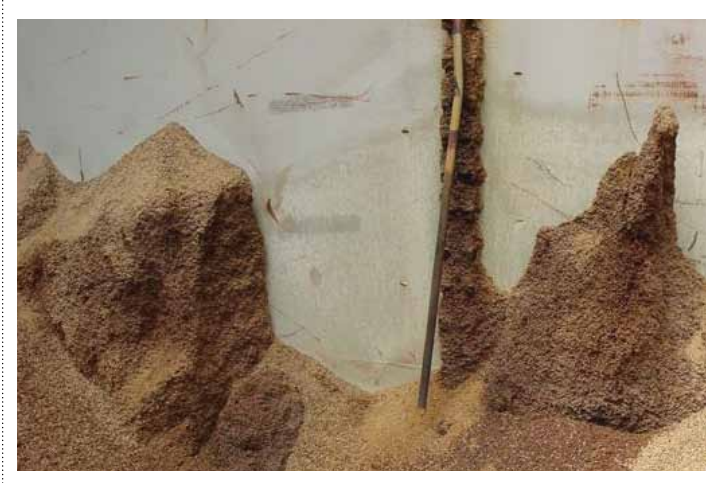
^ Seedcake damage showing a broken temperature gauge

As with other dangerous goods, the IMSBC Code requires hazardous seedcakes to be kept as cool and dry as reasonably practicable, and stowed away from all sources of heat or ignition.