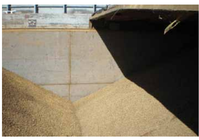
^ Seedcake in hold on completion of loading

Information provided by the shipper shall be accompanied by a cargo declaration form an example is on page 15.