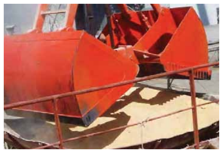
^ Grab loading shoreside hopper