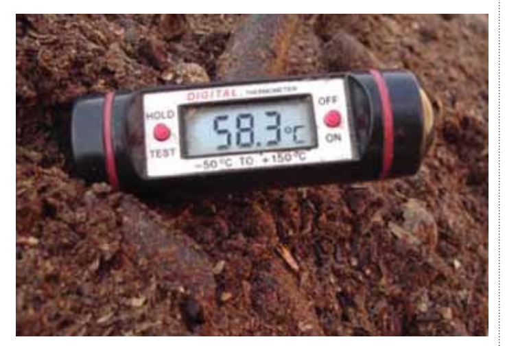
^ Temperature reading taken during self-heating leading to spontaneous combustion

It is important to measure the cargo temperature before and after loading, and during carriage to ensure that incipient signs of self-heating are detected and appropriate action can be taken. Digital thermometers of the type shown below are employed for this purpose.