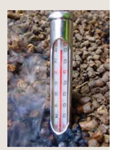
^ Have a thermometer onboard in order to take cargo temperature

A significant amount of the cargo was damaged, with losses in the thousands of dollars. Additional costs were incurred due to: