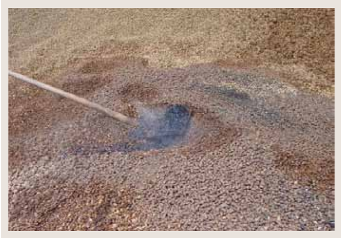
^ Smoking seedcake cargo. Double bottom fuel oil heating should be managed

The location of the fuel oil tanks within the engine room adjacent to the hold bulkhead could be seen from within the hold due to dark heat marks (paint discolouration) at either side of the bulkhead. Additionally, fuel tanks were also located under the tank top of this hold, increasing the amount of heat conducted to the cargo.