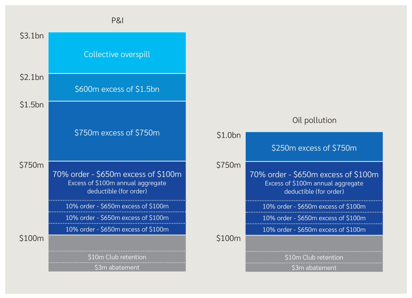
Figure 1: International Group GXL programme structure for 2020/21 \,

Each member of every club contributes to the cost of this 'general excess of loss' (GXL) reinsurance programme based on a rate per gross tonnage that is fixed for each ship type at the start of the policy year.