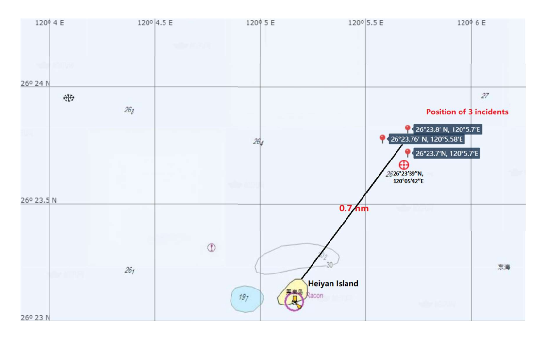
Positions of 3 grounding incidents from 2020 to 2022

The identity of those underwater objects are currently unknown and they are not shown in the present public nautical chart.