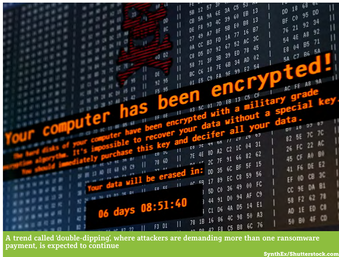
A trend called ‘double-dipping’, where attackers are demanding more than one ransomware payment, is expected to continue

More recent ransomware attacks, such as the “Maze” attacks of 2019, have started to do more than just encrypt data. Lately, criminals have taken to making a copy of the targeted data outside the victim’s network (data exfiltration in cyber security parlance), as well as encrypting it in situ. This provides the opportunity for the criminal to make an initial ransom demand in return for a decryption key and a second, separate demand to ensure the copied data does not fall into the wrong hands.