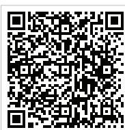
Guidelines on Consistent Implementation of IMO 2020

by suppliers. The circular states that Member States should urge fuel oil suppliers to take into account, as relevant: MEPC.1/Circ.875 Guidance on best practice for fuel oil purchasers/users for assuring the quality of fuel oil used on board ships ; and MEPC.1/Circ.875/Add.1 Guidance on best practice for fuel oil suppliers for assuring the quality of fuel oil delivered to ships . The circular as approved by MEPC 74, can be accessed at the QR Code link provided below.