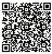
Guidance for Best Practice for Member State/Coastal State