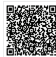
Notification of Early Application of the Verification Procedures for a MARPOL Annex VI Fuel Oil Sample

MEPC 74 approved a unified interpretation to MARPOL Annex VI Regulation 14.1, which confirms that the regulation for the prohibition on carriage of non-compliant fuel oil should also be applied to the fuel oil of emergency equipment.