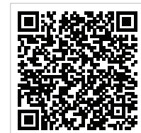
Amendments to MARPOL Annex VI