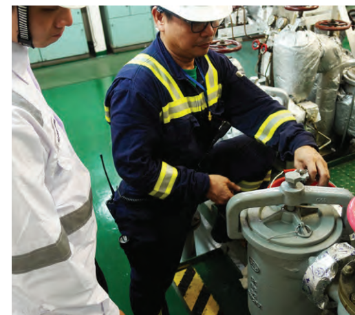
2019 Guidelines for on board sampling for the verification of the sulphur content of the fuel oil used on board ships.

At the sixth session of Sub-Committee on Pollution Prevention and Response (PPR 6 in February 2019), concerns were raised with regard to the sampling of "on board sample" which is the sample of fuel oil in the fuel oil storage tanks (for verification of compliance with the carriage ban). While the sampling procedure for the "MARPOL/delivered sample" and the "in-use sample" have been established, there has been no guidance on how the "on board sample" can be taken safely and in a practical manner to ensure that a homogenous and representative sample of the fuel oil storage tank can be made.