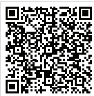
Guidance on Single Failure of EGCS