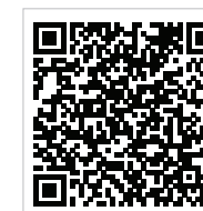
Port State Control Guidelines

In May 2019, MEPC 74 considered the draft interim guidelines and the submissions to MEPC 74. As a result, MEPC 74 approved the Guidance for port State control on contingency measures for addressing non-compliant fuel oil . The guidance can be accessed at the QR Code link provided in page 4.