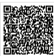
MSC-MEPC Circular -Delivery of Compliant Fuel Oil by Suppliers