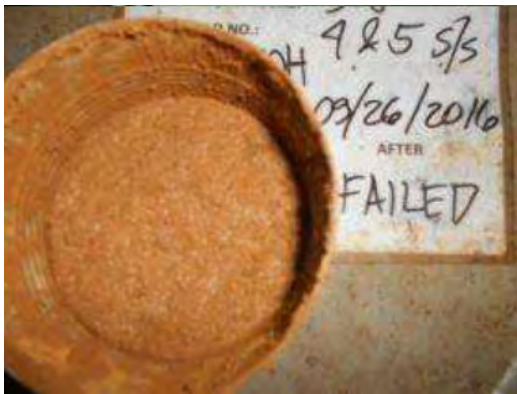
A failed test – flat pancake appearance- - FAIL carry out laboratory analysis of cargo

This is a simple test and as the term implies (can test) a metal can is suitable, such as a coffee tin, paint tin (but must be clean). Take about 1 to 2 kg of the ore and place it in the tin, repeatedly slam the can the bulk code says 25 times, if the ore remains the same then there are no obvious signs of moisture, if it shows any signs of liquefying (very obvious will be where free water appears on top or takes on a shiny flat appearance ) then the cargo should be rejected and not loaded .